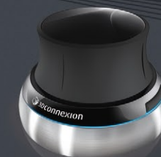
SpaceNavigator™ for Notebooks Portable 3D Mouse

With SpaceNavigator™ or SpaceNavigator™ for Notebooks, everyone can enjoy the freedom of professional 3D navigation, at home, at work or on the road.