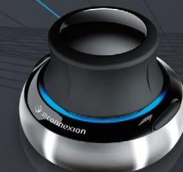
SpaceNavigator™ 3D Mouse

SpaceNavigator for Notebooks is two thirds the size and half the weight of its desktop counterpart. Its convenient protective travel case makes it ideal for mobile 3D users.