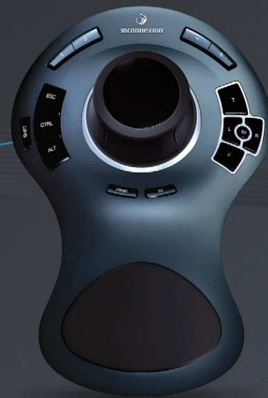
SpaceExplorer™ Professional 3D Mouse

SpaceExplorer is the 3D mouse of choice for design professionals who demand performance, comfort and style.