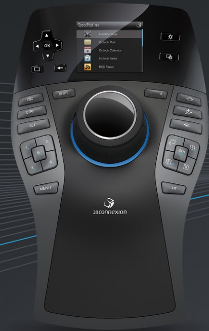
SpacePilot™ PRO The Ultimate Professional 3D Mouse

SpacePilot PRO is the ultimate professional 3D mouse, engineered to excel in today's most demanding 3D software environments.